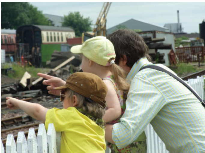
Spotting fun on the new Visitor Trail to the Museum

The Museum is full of historic locos & other railway items, family favourites include changing the signals , sorting letters in the Travelling Post Office and climbing on the locos .